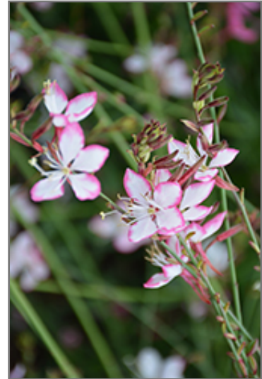
Rosy Jane Gaura flowers

Rosy Jane Gaura is recommended for the following landscape applications;