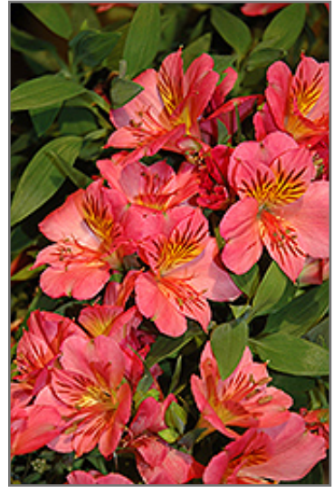
Colorita Eliane Alstroemeria flowers

Colorita Eliane Alstroemeria is recommended for the following landscape applications;