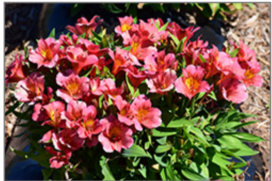
Colorita Eliane Alstroemeria in bloom