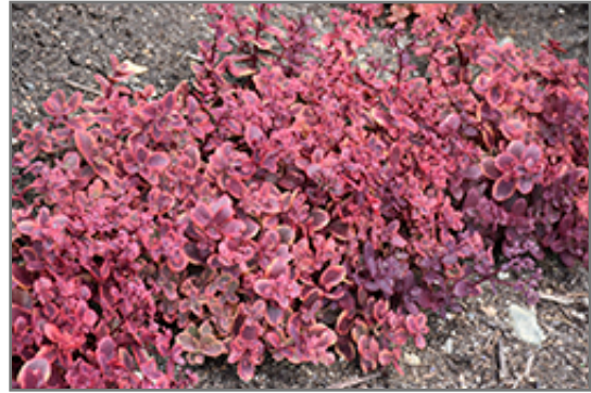
Wildfire Sedum