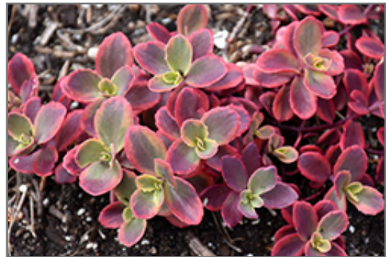
Wildfire Sedum foliage