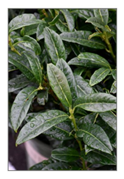
Laurel, Cherry Chestnut Hill foliage