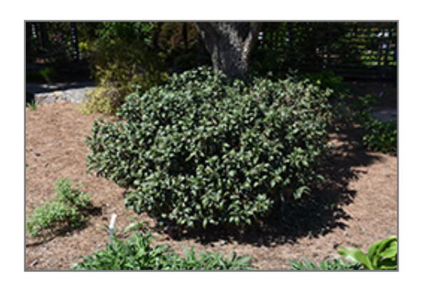
Laurel, Cherry Chestnut Hill