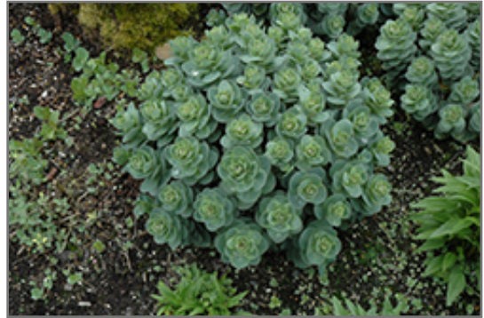
Rosetta Sedum

Rosetta Sedum is recommended for the following landscape applications;