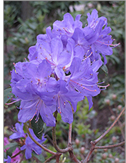
Blue Baron Rhododendron flowers