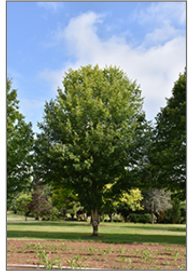
Maple, (Sugar) Belle Tower