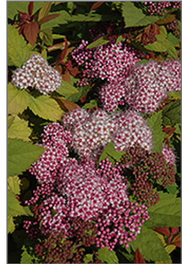
Spiraea, Double Play Big Bang flowers

Spiraea, Double Play Big Bang is recommended for the following landscape applications;