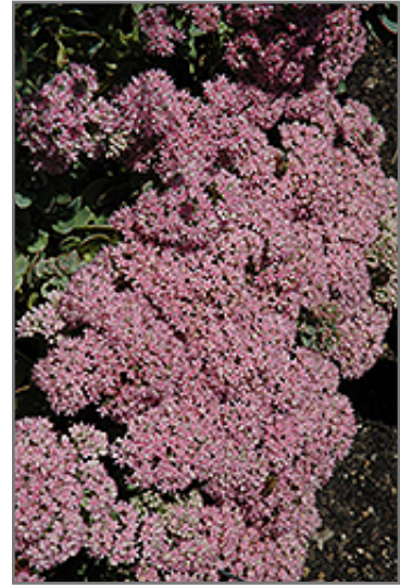
Lime Zinger Sedum flowers

Lime Zinger Sedum is recommended for the following landscape applications;