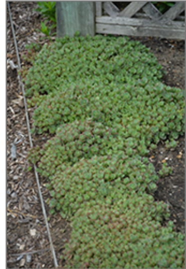
Lime Zinger Sedum

Lime Zinger Sedum is a fine choice for the garden, but it is also a good selection for planting in outdoor pots and containers. Because of its spreading habit of growth, it is ideally suited for use as a 'spiller' in the 'spiller-thriller-filler' container combination; plant it near the edges where it can spill gracefully over the pot. Note that when growing plants in outdoor containers and baskets, they may require more frequent waterings than they would in the yard or garden.