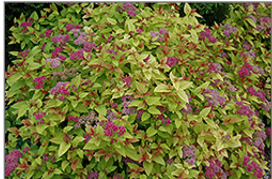
Spiraea, Magic Carpet flowers