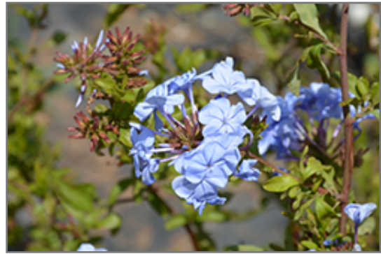
Imperial Blue Plumbago flowers

Imperial Blue Plumbago is recommended for the following landscape applications;