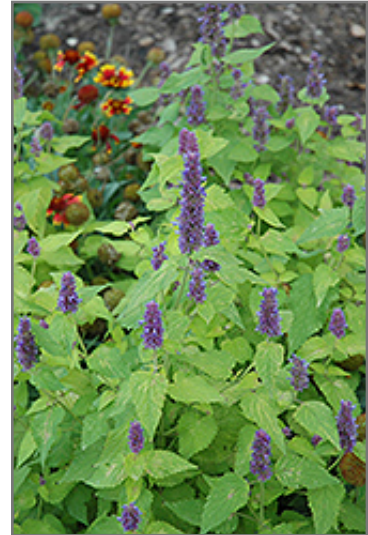
Golden Jubilee Hummingbird Mint flowers

Golden Jubilee Hummingbird Mint is a dense herbaceous perennial with an upright spreading habit of growth. Its medium texture blends into the garden, but can always be balanced by a couple of finer or coarser plants for an effective composition.