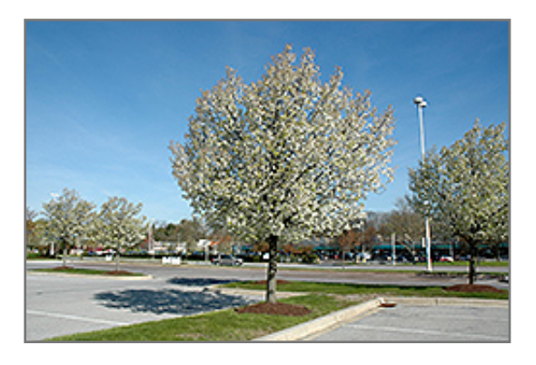
Pear, (Ornamental) Autumn Blaze in bloom