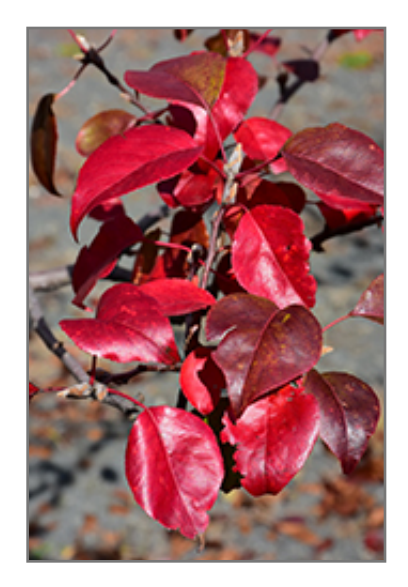
Pear, (Ornamental) Autumn Blaze in fall

This tree should only be grown in full sunlight. It prefers to grow in average to moist conditions, and shouldn't be allowed to dry out. To help this plant achive its best flowering performance, periodically apply a flower-boosting fertilizer from early spring through into the active growing season. It is not particular as to soil type or pH. It is highly tolerant of urban pollution and will even thrive in inner city environments. This is a selected variety of a species not originally from North America.