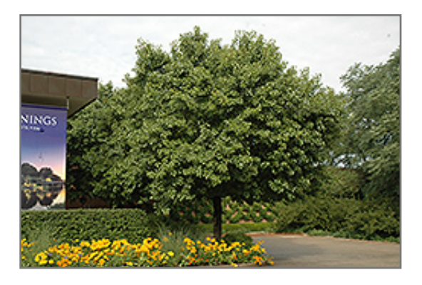
Pear, (Ornamental) Autumn Blaze