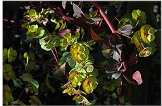
Ruby Glow Euphorbia flowers