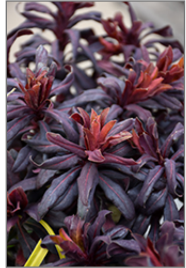
Ruby Glow Euphorbia flowers

Ruby Glow Euphorbia is recommended for the following landscape applications;