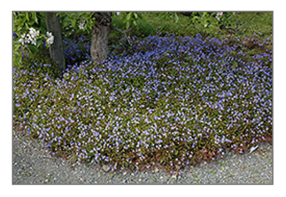
Georgia Blue Veronica in bloom