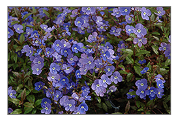
Georgia Blue Veronica flowers

Georgia Blue Veronica is recommended for the following landscape applications;