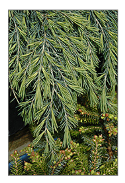
Cedar, (Deodara) Feelin' Blue foliage