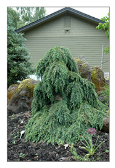
Cedar, (Deodara) Feelin' Blue