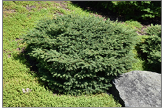
Spruce, Birds Nest