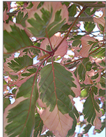
Beech, Tri Color foliage