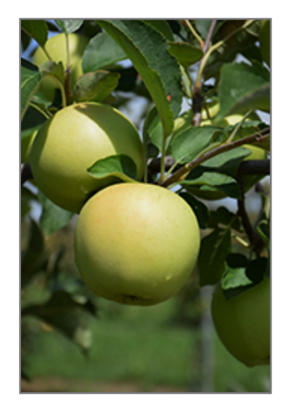
Apple, Golden Delicious (Semi Dwarf) fruit