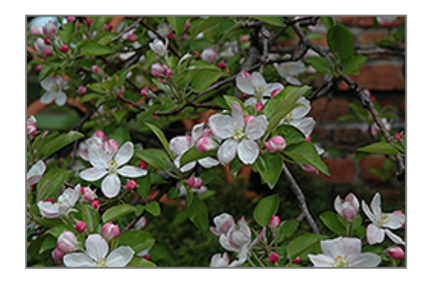
Apple, Golden Delicious (Semi Dwarf) flowers