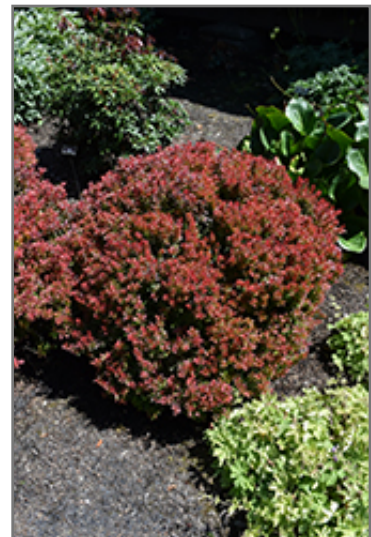
Barberry (Japanese), Golden Ruby